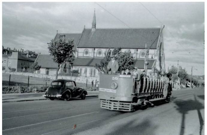
Pictured above: Not a way you can travel to St Paul's any more! Llandudno and Colwyn Bay tram number 20 passes the church on 3rd September 1955. The disappearance of the trams isn't the only thing to have changed in the last 63 years. The church hall has since sprung up alongside St Paul's, and flats have replaced the open space of the putting green on the left.

And there was a woman who was due to get married in Llandudno register office that afternoon, and who came inside with her