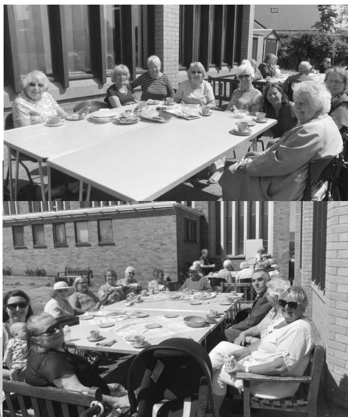
Pictured above: The June Community Afternoon Tea at St David's Church Hall.