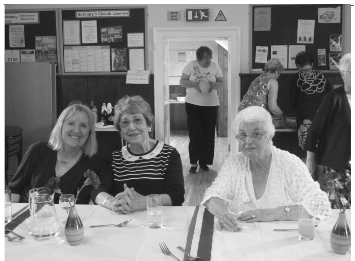
Pictured above: Some of the happy diners who gathered at Llanrhos schoolroom to celebrate the Royal Wedding.